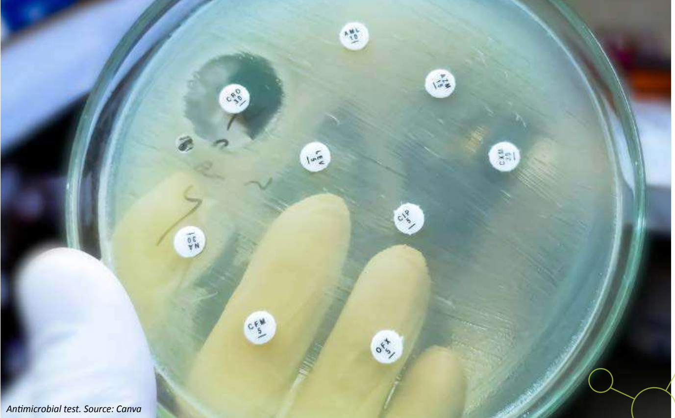
Antimicrobial test.